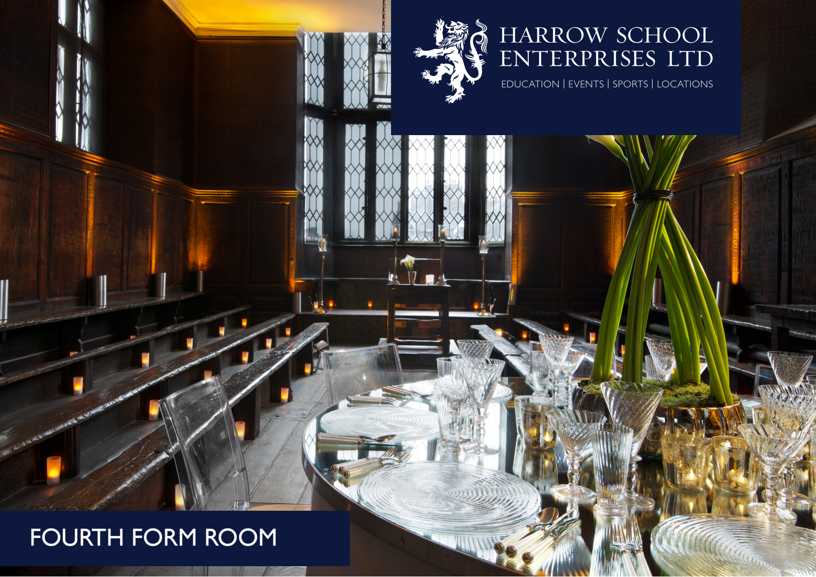
FOURTH FORM ROOM